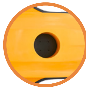
ADCP access shaft